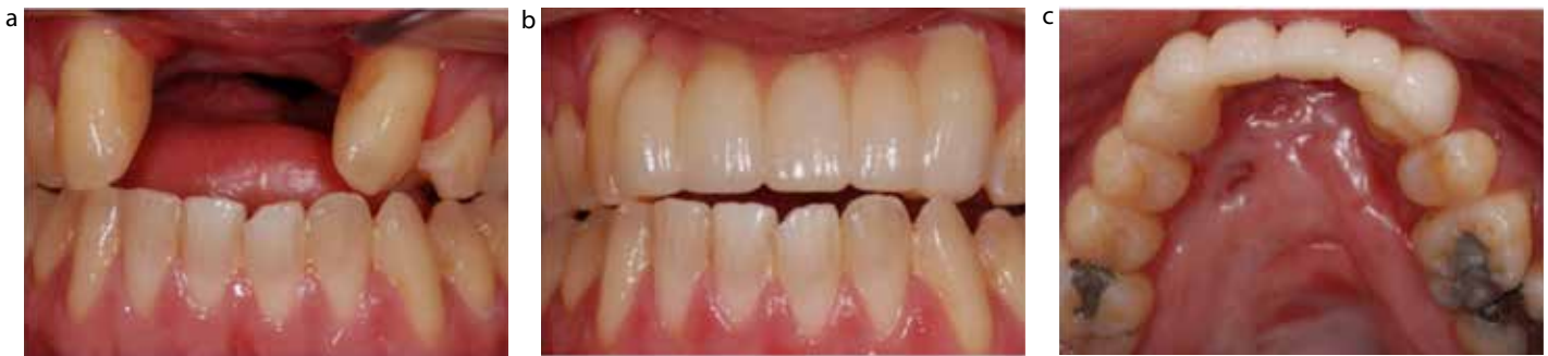
Figure 5. A large span ceramic RBB case. (a) Pre-operative labial view of missing UR2–UL2 in a patient with a repaired cleft lip and palate. There is a history of a failed bone graft. (b) Post-operative labial view of an all-ceramic RBB replacing UR2–UL2, using the upper canines as abutments. Note the fact that the labial surface of the UL3 has been used as the bonding surface. Pink porcelain has been used to restore pink aesthetics. The patient's occlusion (anterior open bite) is favourable in terms of the loading of the adhesive ceramic bridgework. (c) Post-operative occlusal view of the all-ceramic RBB showing the thick framework, including the connectors, to maintain rigidity required for ceramics.