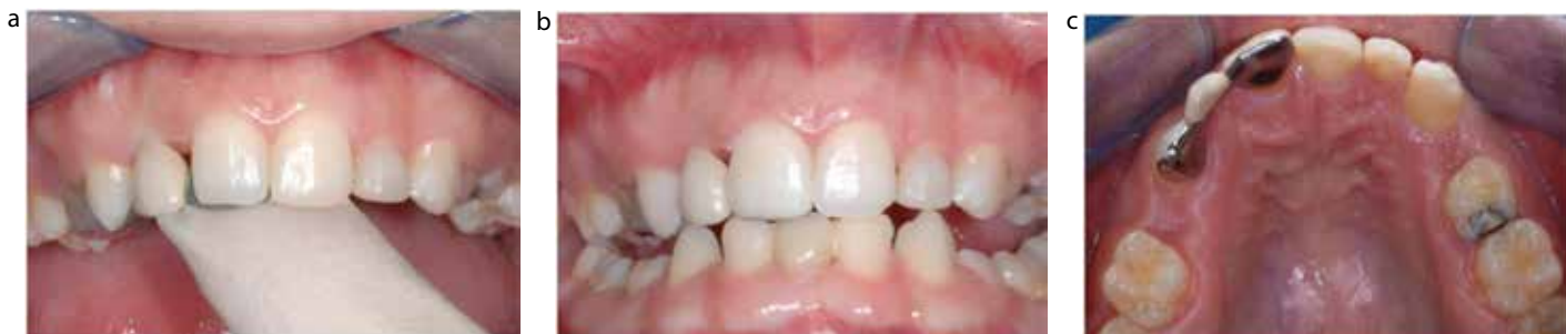
Figure 4. The use of a RBB framework that incorporates the modification of the abutment with resin composite to eliminate spacing. This would require good communication with the lab, and ideally a diagnostic wax-up to guide the framework stent. (a) The RBB is tried in to assess fit and the shape of the framework stent that will guide the diastemata closure between UR1–UR2 and between UR2–UR3. The dental technician was asked to modify the morphology of UR1 on the cast prior to bridge construction, thus leaving a space between the altered portion and unmodified abutment tooth. (b) The bridge is cemented, leaving a thin layer of opaque Panavia F2.0 luting cement over the exposed retainer wing and the void is then filled with resin composite, which has been extended onto the labial surface of enamel to increase bonding area. It is important that sufficient contact is maintained between the wing and the unmodified abutment tooth to allow positive seating of the bridge. The use of a dentine shade of resin composite is recommended, as this is less translucent than enamel shades and the opaque luting cement should be extended over the exposed fit surface of the retainer wing to prevent shine through of the metal and resulting greying appearance of the resin composite addition. There is an aesthetic compromise due to the black triangle formation, and the difference in proportions between the upper central incisors. (c) Occlusal view.

The scope of this article is limited to traditional adhesive bridges using non-precious metal to manufacture the framework, although the use of ceramics for this technique is growing in popularity. There is little published evidence in relation to the use of ceramic as the framework material for adhesive bridgework compared with metal alloys. 14 The advantage of an aesthetic, metal-free framework is countered by the need for an increased cross-sectional area of the connector to maintain strength and rigidity, which itself may hinder the final aesthetic potential of the pontic and the embrasure spaces. This may mean that using ceramics may not be feasible in some cases due to a lack of strength of the framework. The most common cause of failure of all-ceramic RBBs is fracture of the framework, which is a less favourable mode of failure compared to metal RBBs where a complete de-bond is observed more commonly. 14 Furthermore, the overall thickness of the ceramic framework necessary to maintain strength and rigidity would necessitate an over-contoured framework, which may compromise ultimate cleansability, aesthetics and interocclusal space. The alternative is to create the space for the required thickness of framework by tooth preparation, which may be more invasive. The removal of tooth structure to create enough space for an appropriately rigid ceramic framework may expose dentine, which would compromise the bond to abutment teeth.